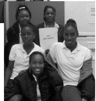
Members of Dobie Middle School’s Girl Talk group

AISD’s Dropout Prevention/Reduction Office Newsletter